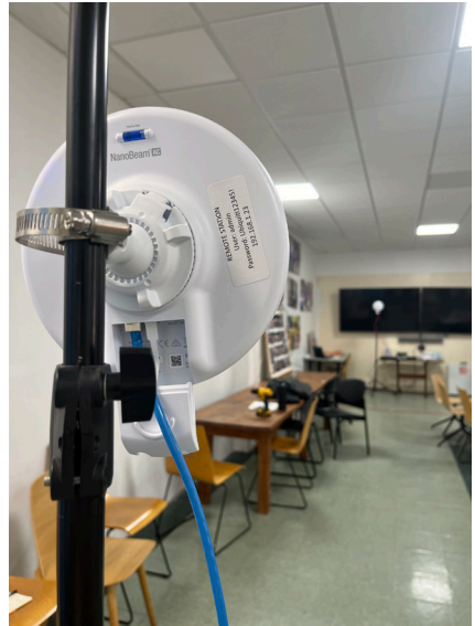
Building new PNKS and testing antennas at CTNY