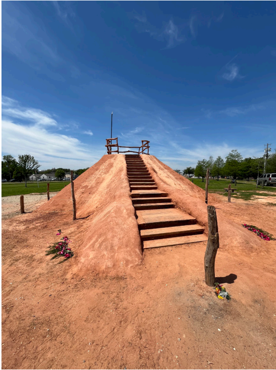
Antenna at Nanih Bvlbancha