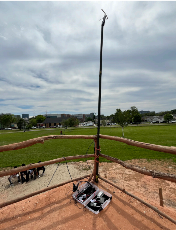
View of antenna from the top of Nanih Bvlbancha

We will be hosting our second DiscoTech "Sunday Signals" at Nanih Bvlbancha on August 25, 2024. During this DiscoTech we will be testing the range of our network to see how far we can send and receive a signal from our network.