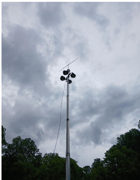
Antenna on Cherokee Lands for PME Conference